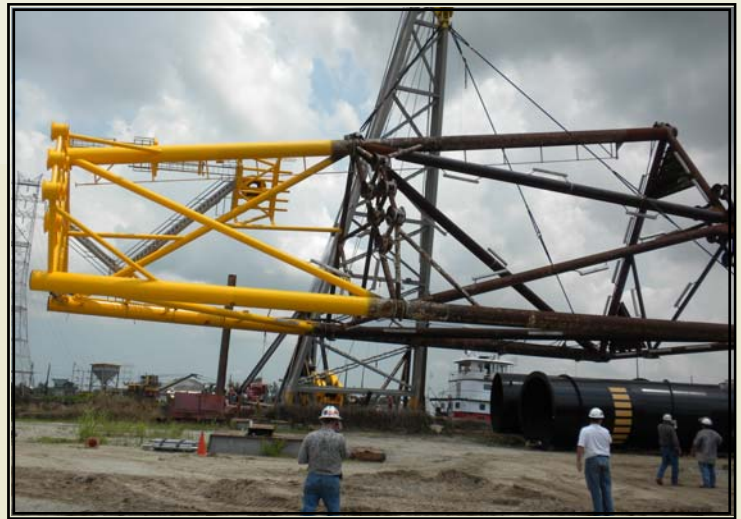
Above: ERT Loadout