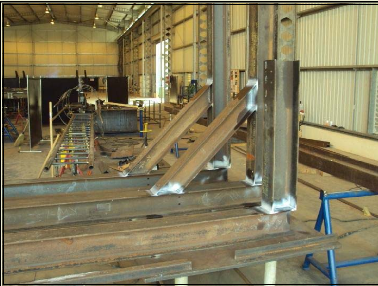
Crude Meter Prover Platforms— Kizomba “A” and “B”

The compilation of the document package for client acceptance.