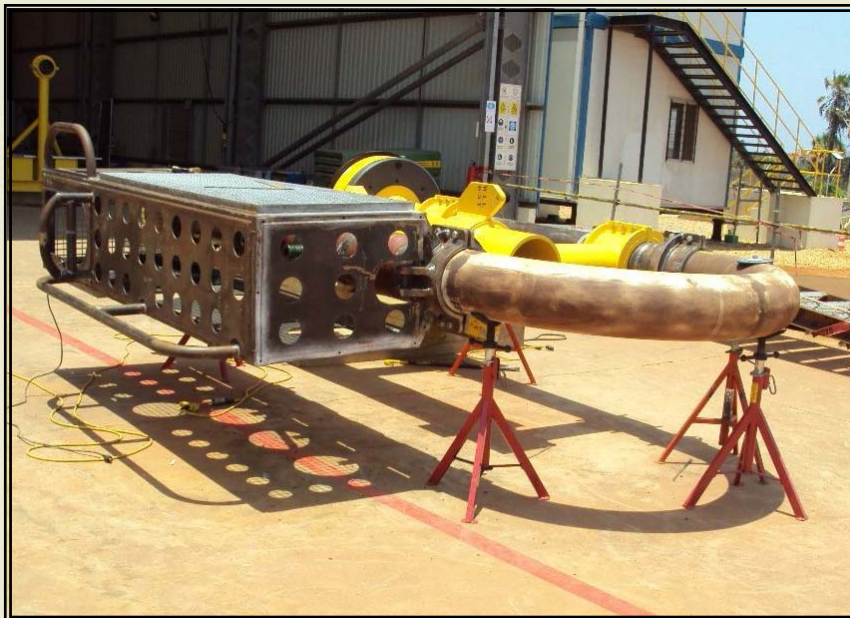
Pig Launcher & Receiver Fabrication