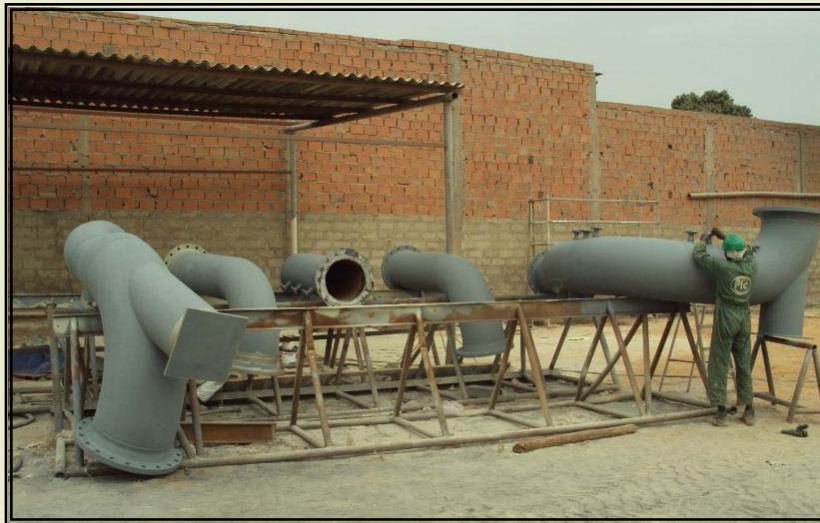
Cooling Medium Heat Exchangers

The project was carried out over a four month period.