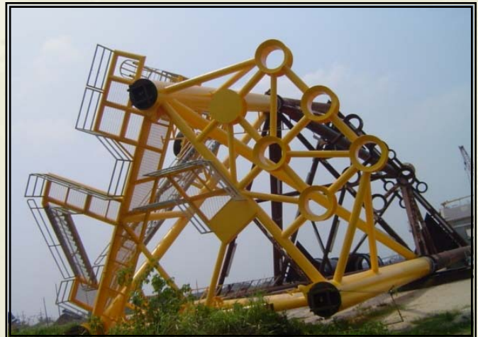
Left: Deck Above: Jacket