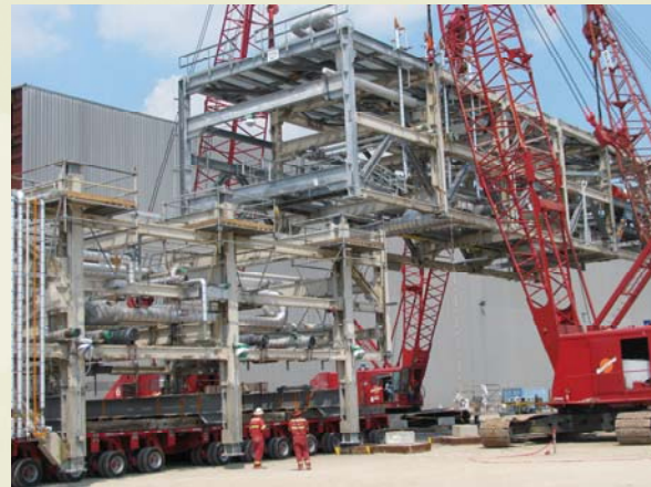
GOHT Modules being stacked for loadout

August 25th marked yet another milestone in dii's East Yard with the successful achievement of 2,500,000 manhours without a lost time accident. To accentuate the event, dii sponsored a luncheon for all dii, Client and subcontract personnel.