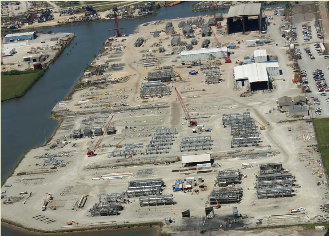
Overall view of the East Yard with Fluor and Jacobs modules under construction.

Fluor and Jacobs were the agents representing BP for the project. Fluor was the agent for three pillars and Jacobs was the agent for one pillar. The three Fluor pillars were the Outside Battery Limit (OSBL) pillar, the 12 Pipe Still (12PS) pillar and the Gas Oil Hydro-treater (GOHT) pillar. The Jacobs pillar was the Sulfur Recovery Complex (SRC) pillar. Each pillar has multiple modules. The OSBL pillar has 190 modules, the 12PS pillar has 63 modules and the GOHT pillar has 26 modules. The Jacobs SRC pillar had 73 modules.