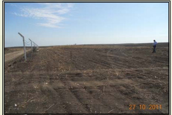
Start of Construction