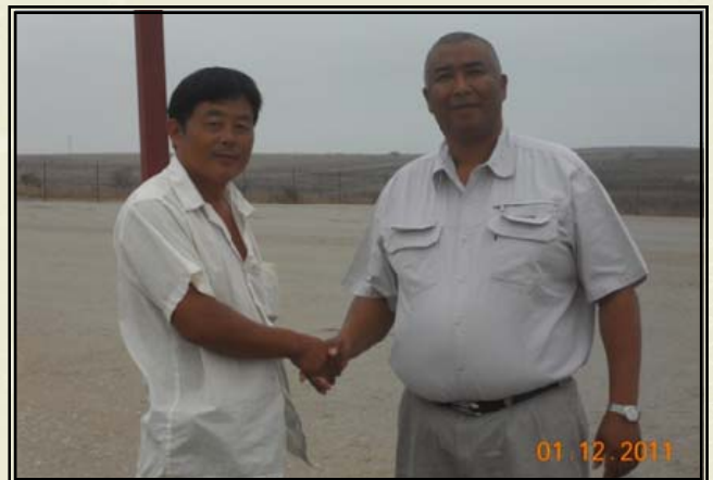
Project Manager & Site Supervisor