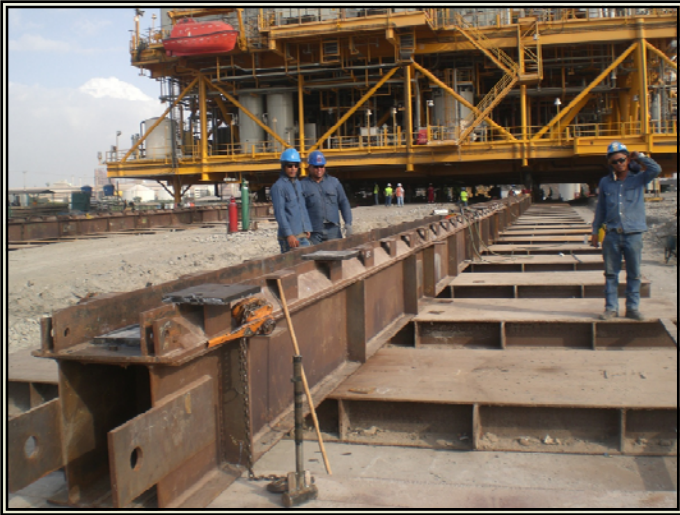
Left: The CPF Platform in Alianza Facility ready for Load Out