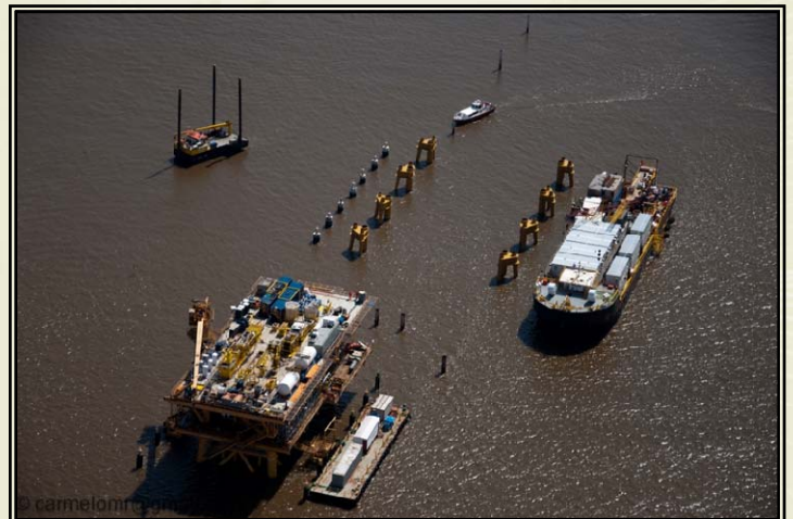
Below: Wellhead Platform and MV Carolyn at installation site