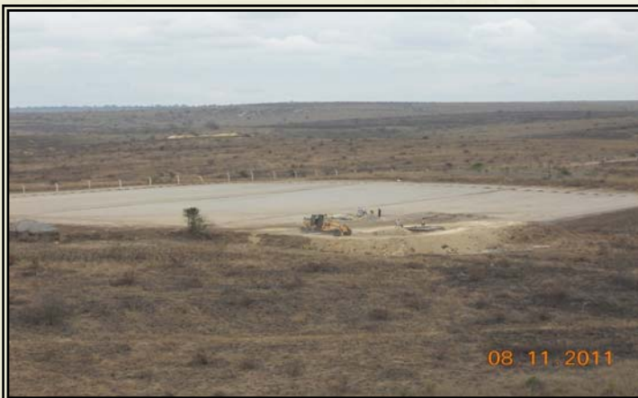
Progress of site construction