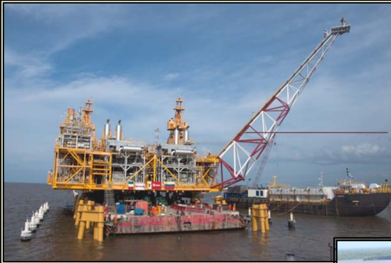
Above: CPF Platform during float over installation with MV Carolyn alongside