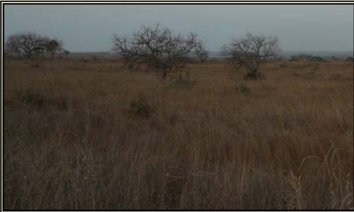
Campsite before construction started

Construction of Dande Camp mobilized 23 October 2011