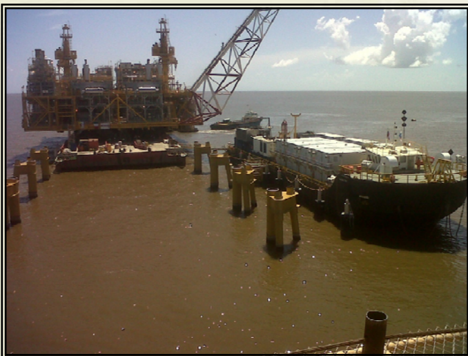
Left: CPF Topside on Transport Barge prior to Float Over with MV Carolyn alongside