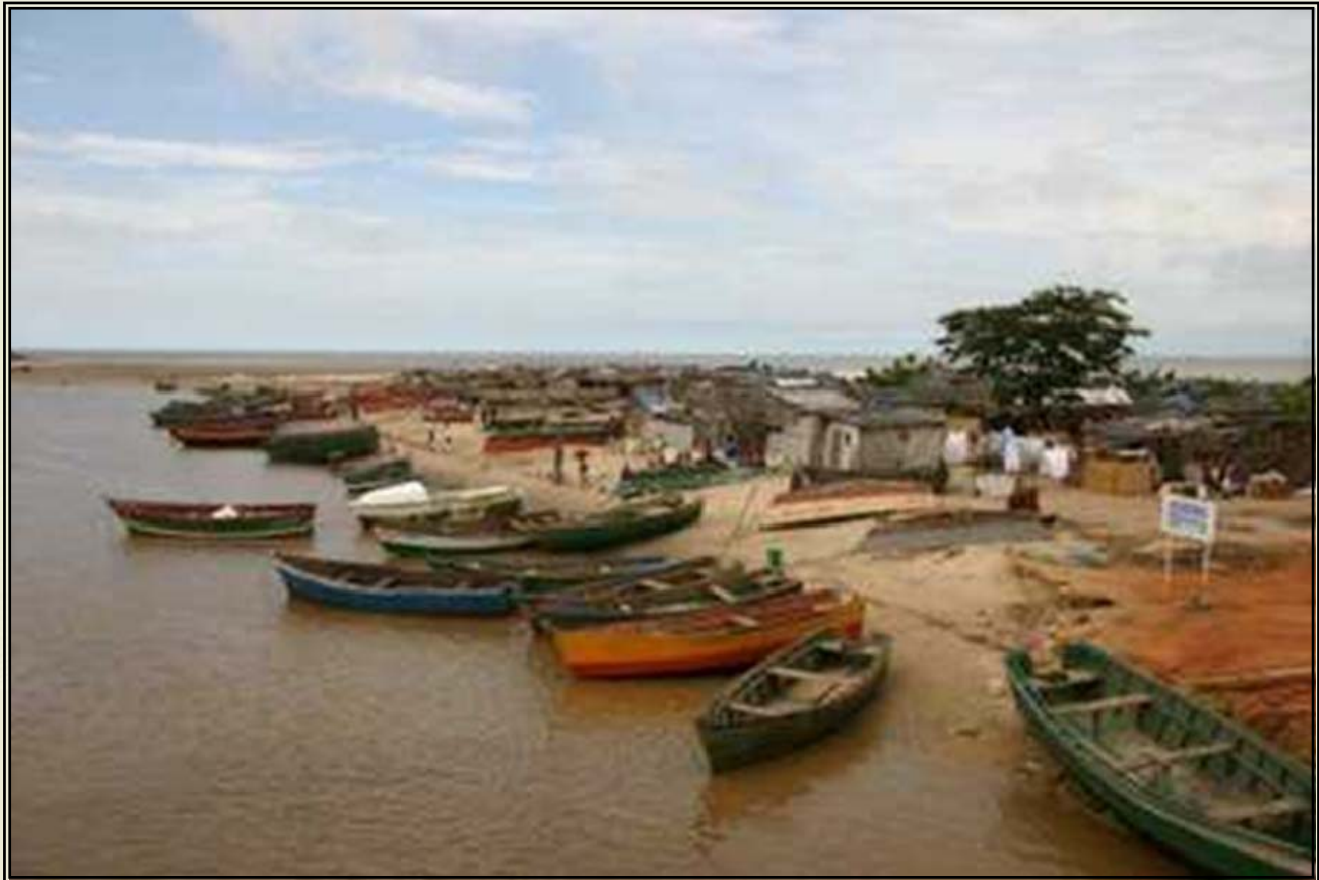
Fishing Village Barra Do Dande

Situated about 60km from Luanda International Airport