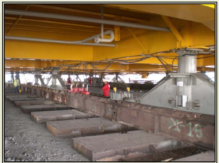
Below: Hydraulic Skid Shoes were utilized for Load Out