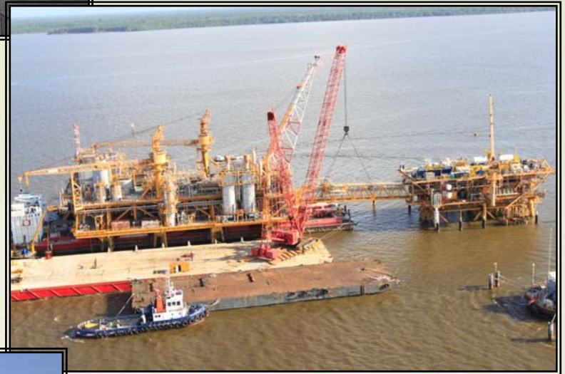
Below: The MV Carolyn in foreground, CPF Facility In background and Wellhead Platform far left