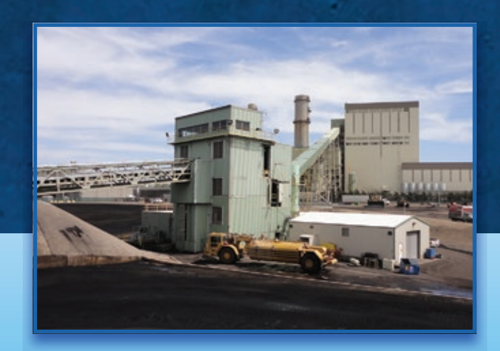
ENERGY & POWER